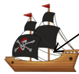
a pirate ship